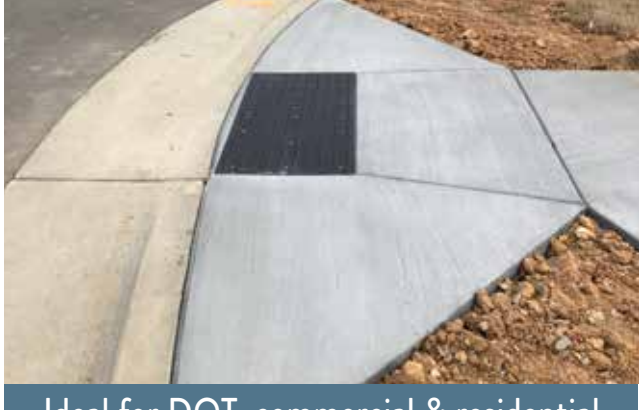
Ideal for DOT, commercial & residential