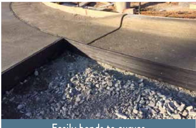
Easily bends to curves